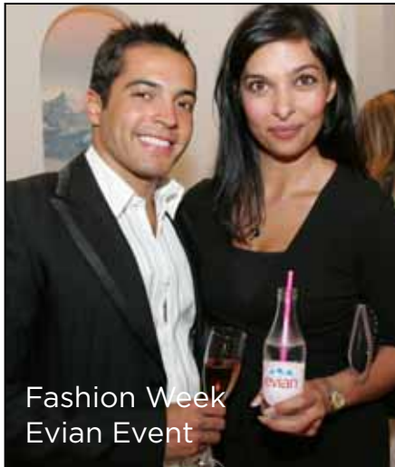
Fashion Week Evian Event